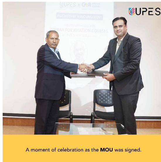
A moment of celebration as the MOU was signed.