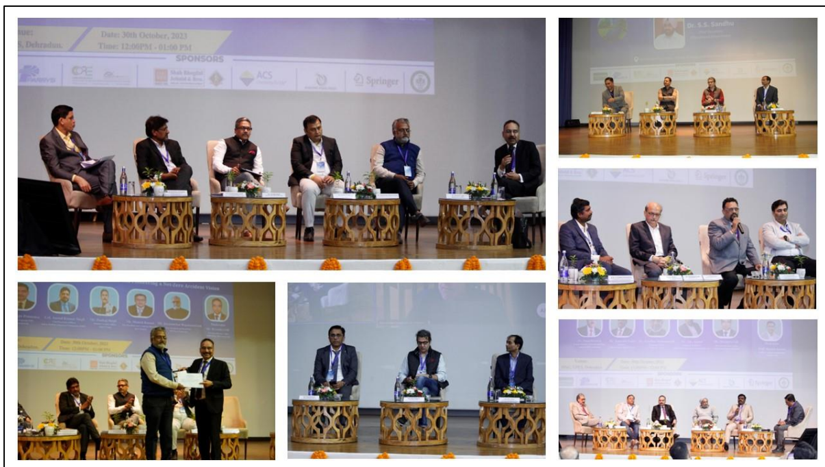
Glimpses of Panel Discussions