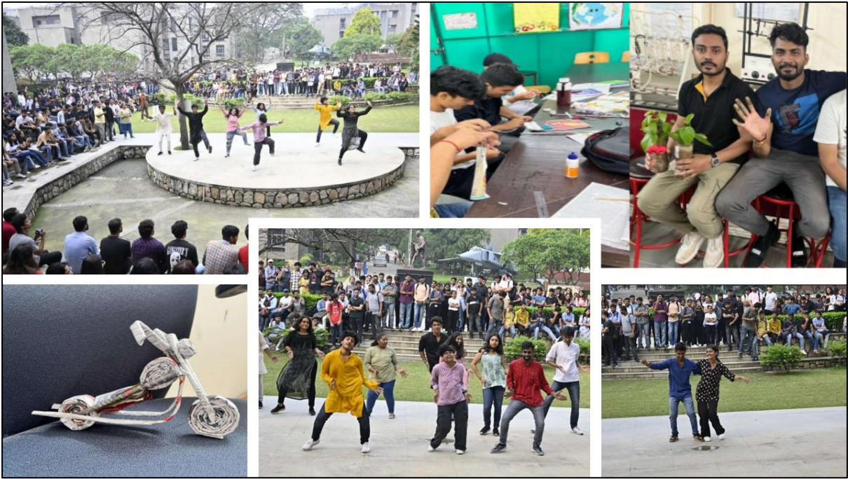
Pre-conference activities in campus