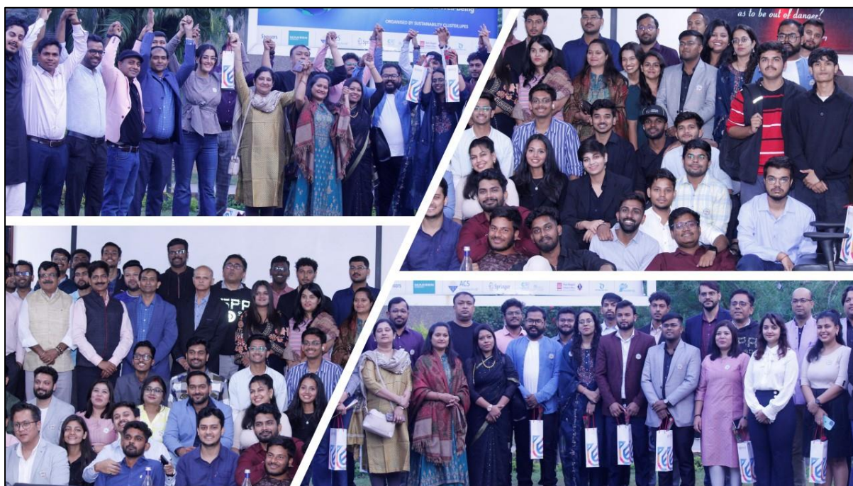
Mega Alumni Connect

The evening concluded with the felicitation of the alumni by the career services and the Sustainability Fair Committee. It was decided to continue this event as the annual meet under the umbrella of the Sustainability Fair.