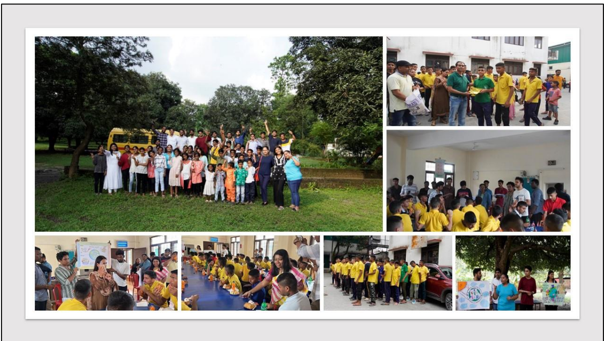
Pre-conference activities of orphanage visit