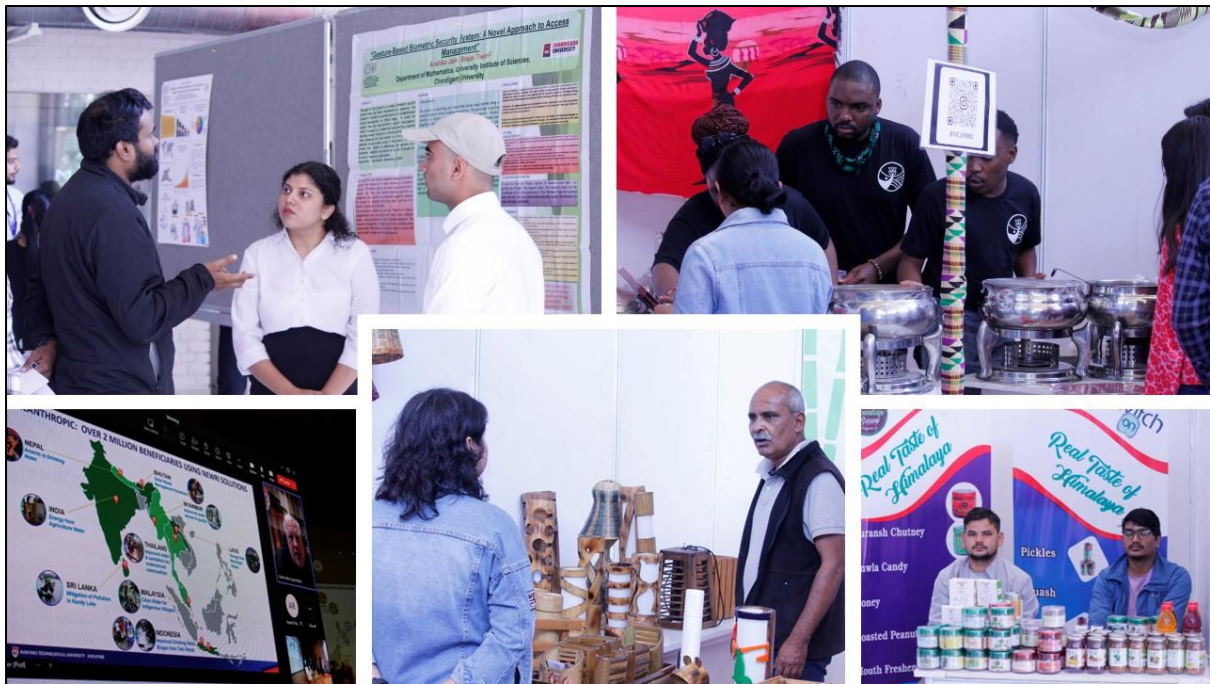
Exhibitors and Poster Presentations

A total of around 33 exhibitors participated in the Sustainability Fair 2.0 – 4 th International Sustainability Conference on Health, Safety, Fire & Environmental Advances on both the days (30 th October and on 31 st October 2023). The exhibitors were from industries, academia and NGOs and Cooperative societies. They all showcased and sold their product to participants, students and faculties of different schools, and delegates from all over the country. The exhibition space offered the exhibitors an opportunity to showcase their products, services, and innovations to a global audience of industry professionals, experts, and decision-makers. The list of exhibitors includes Indian Hemp Store, Eco Karma, Himalayan Women Self Reliant Cooperative Society, Fire Safety Consulting, Makeen Energy, Fyoli Haat, Uttarakhand Gram Vikas Samiti, among the others.