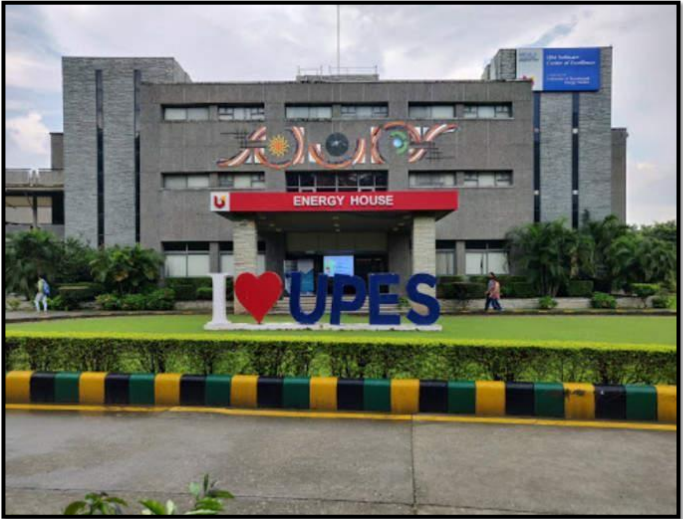
Day 1: UPES Bidholi