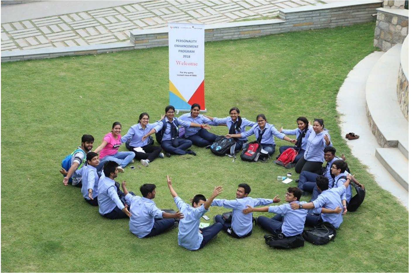
Day 1: UPES Bidholi, Afternoon session